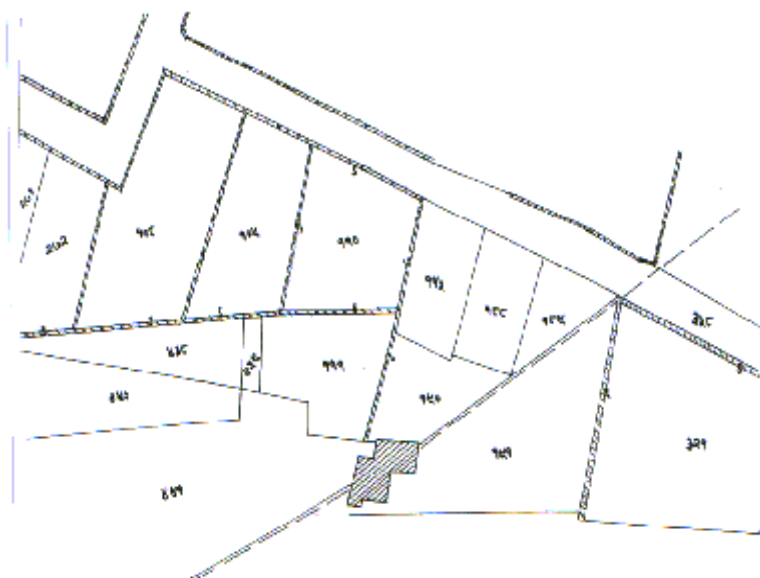
Fig 2 :- Part of Cadastral Map based on National Control Network.