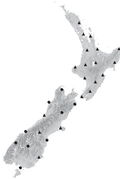
Figure 2. Active control network (Chatham Island excluded). Triangles represent operating stations as at July 2003 and circles planned stations.

In 2001 LINZ commenced development of an active control network (PositionNZ) in partnership with the Institute of Geological and Nuclear Sciences (GNS). PositionNZ stations are the highest accuracy points in the New Zealand Geodetic Datum 2000. A continuous tracking GPS receiver located