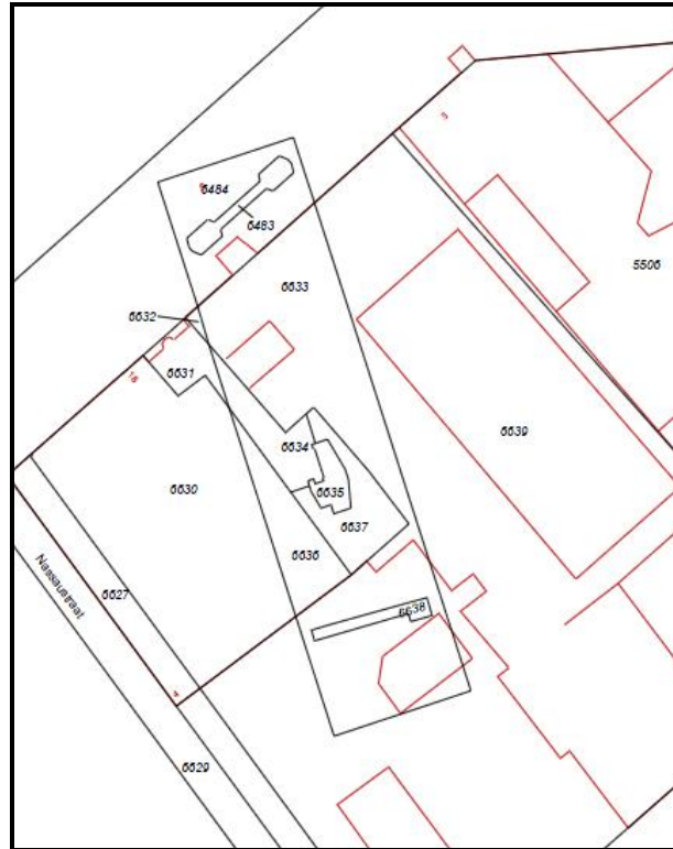
Figure 1. The Bridge ('De Brug') building in Rotterdam above other buildings and roads with the cadastral map of this situation.

The limited advances in full 3D cadastre implementations throughout the world, might be explained by the fact that the implementation of a 3D cadastre requires close collaboration between legal and technical experts in an empirical environment to understand the impact of each other's domain. Therefore this paper presents the developments in the Netherlands where achieved research results on 3D cadastre are brought into practice. Also in an international perspective this is an important step forward.