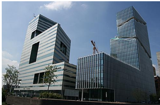
Figure 2. Photograph of the real situation of case of type 2 (building on the right side)

An example of a complex, multi-level property situation (type 2) is the creation of two 3D property rights for a building (an office tower) on one hand and the underground parking under it on the other hand. The example given is located at the South-axis business district of Amsterdam (Figure 2). The foundation piles of the office tower are situated in the underground parking. For both constructions long leaseholds have been established by the land owner, the municipality of Amsterdam. As land owner the municipality retains all rights on the public space on the roof of the parking that is not occupied by the office tower; as near the entrance of the building (shown in Figure 2).