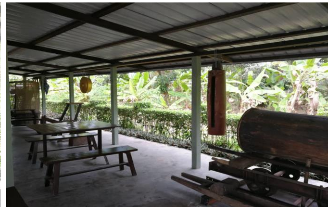
Some activities at Rumah Tradisional