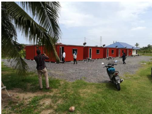
Check-In - (Cabin Style) Homestay Sg. Sireh, Tg, Karang