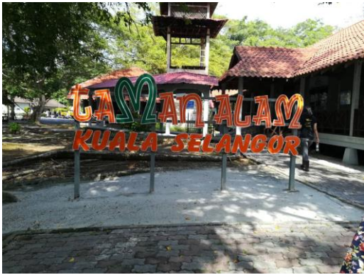
Taman Alam Kuala Selangor – Mangrove Tour and Planting.