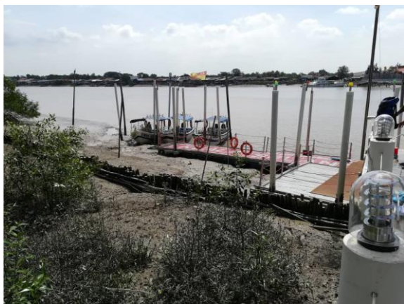
Sky Mirror Jetty