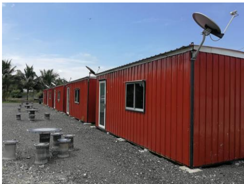
2 person/ cabin. Aircond, Water heater, Queen Bed, LCD TV with Astro Safety, Cleanliness – highlighted to Operator