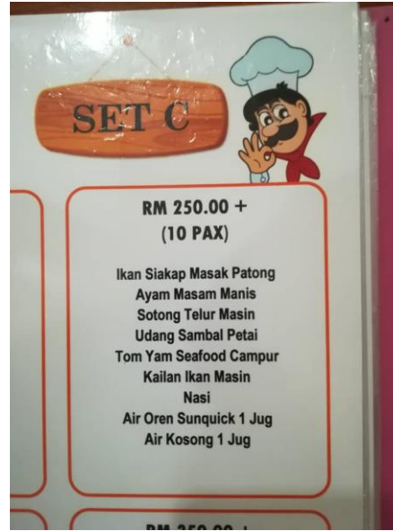
All participants needs are taken into consideration – Vege etc.