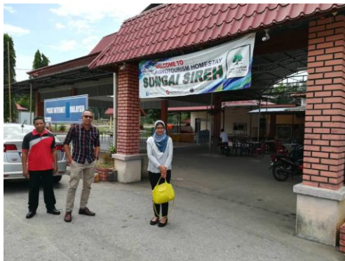
Sg. Sireh, activities Centre – Breakfast Location. Village Tour (by trem)