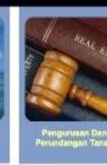
Pengurusan Dan Perundangan Tanah