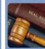
Pengurusan Dan Perundingan Tanah