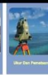
Ukur Dan Pemetaan