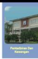
Pentadbiran Dan Kewangan