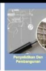
Penyelidikan Dan Pembangunan