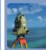
Ukurl Dan Pemetaan