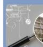
Penyelidikan Dan Pembangunan