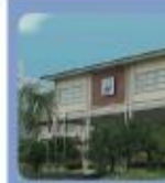
Pentadbiran Dan Kewangan