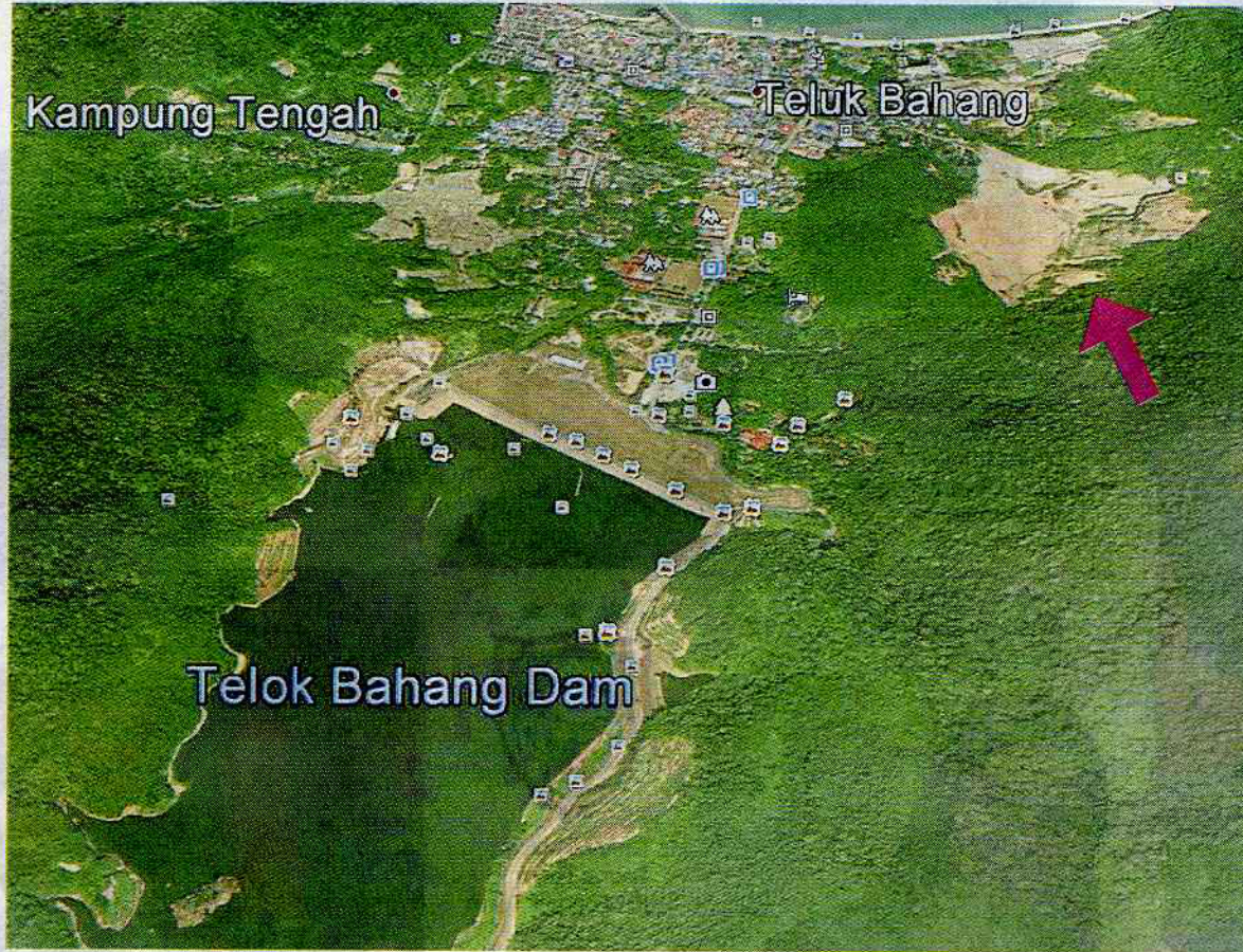
Ariel view: A screen capture from Google Earth showing the expanse of cleared land in Teluk Bahang.

The lowest point of the clearing is 23m above sea level and the highest point is 103m above sea level.