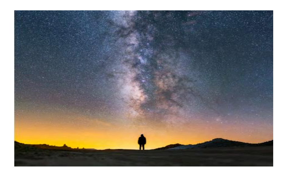
Figure 1.10 Milky Way Galaxy. Because we are inside the Milky Way Galaxy, we see its disk in cross-section flung across the sky like a great milky white avenue of stars with dark "rifts" of dust. In this dramatic image, part of it is seen above Trona Pinnacles in the California desert.

Typically, the interstellar material is so extremely sparse that the space between stars is a much better vacuum than anything we can produce in terrestrial laboratories. Yet, the dust in space, building up over thousands of light-years, can block the light of more distant stars. Like the distant buildings that disappear from our view on a smoggy day in Los Angeles, the more distant regions of the Milky Way cannot be seen behind the layers of interstellar smog. Luckily, astronomers have found that stars and raw material shine with various forms of light, some of which do penetrate the smog, and so we have been able to develop a pretty good map of the Galaxy.