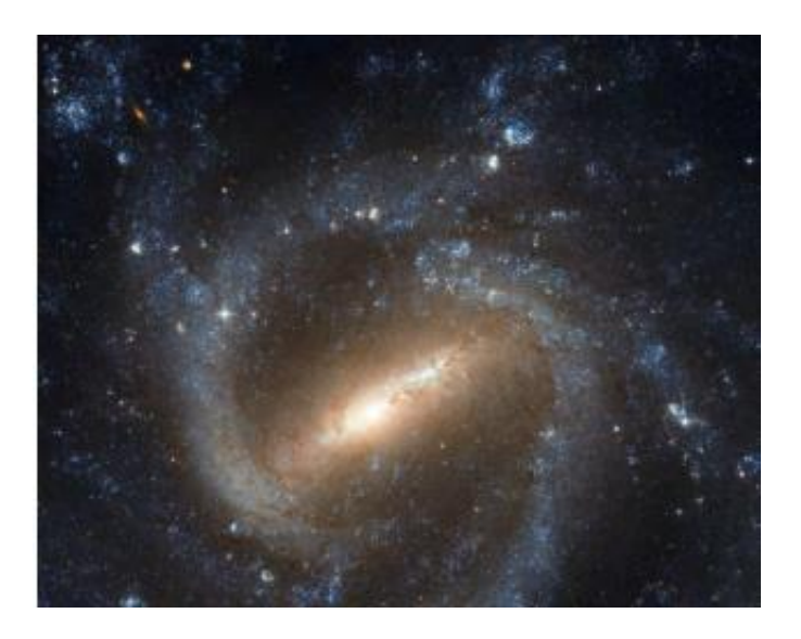
Figure 1.9 Spiral Galaxy. This galaxy of billions of stars, called by its catalog number NGC 1073, is thought to be similar to our own Milky Way Galaxy. Here we see the giant wheel-shaped system with a bar of stars across its middle.

light-years, we finally encompass the entire Milky Way Galaxy. Our Galaxy looks like a giant disk with a small ball in the middle. If we could move outside our Galaxy and look down on the disk of the Milky Way from above, it would probably resemble the galaxy in Figure 1.9, with its spiral structure outlined by the blue light of hot adolescent stars.