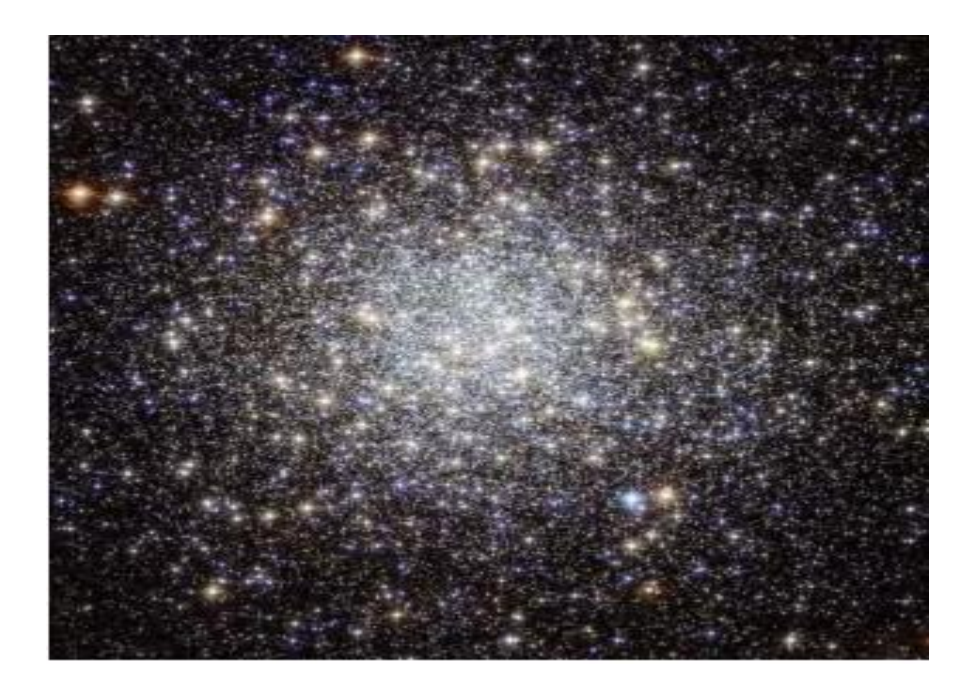
Figure 1.11 Star Cluster. This large star cluster is known by its catalog number, M9. It contains some 250,000 stars and is seen more clearly from space using the Hubble Space Telescope. It is located roughly 25,000 light-years away.

You may hear stars referred to as "eternal," but in fact no star can last forever. Since the "business" of stars is making energy, and energy production requires some sort of fuel to be used up, eventually all stars run out of fuel. This news should not cause you to panic, though, because our Sun still has at least 5 or 6 billion years to go. Ultimately, the Sun and all stars will die, and it is in their death throes that some of the most intriguing and important processes of the universe are revealed. For example, we now know that many of the atoms in our bodies were once inside stars. These stars exploded at the ends of their lives, recycling their material back into the reservoir of the Galaxy. In this sense, all of us are literally made of recycled "star dust."